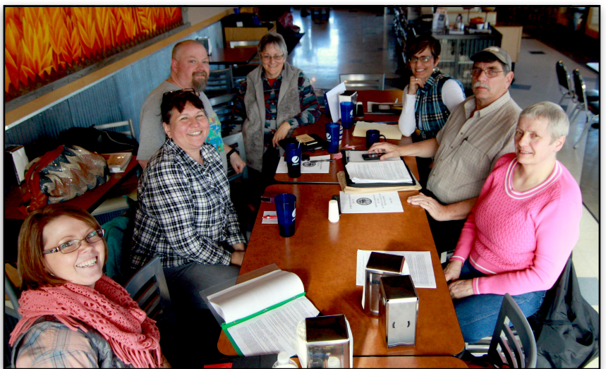
The boards of NAPUS and League discuss the bylaws of UPMA, which will unite us in November

give you a little history about the Calvert Hotel. As the county seat, Lewistown was responsible for providing educational facilities for its residents. Schools were built and teachers were hired as required by law. -However, Fergus County encompasses a tremendous area and it was impossible to bring all students into Lewistown daily for their required education. Adequate housing was at a premium because of this rapid expansion and boarding houses were few and very expensive. In 1915 the school administrator recommended that a dormitory be built. On February 1, 1917 the dormitory opened. It was a fine structure, made of native brick rising two and one half stories above ground level, with 27 rooms adequate for about 50 students. The young gentlemen's rooms were on the main floor, with a parlor and rooms for young ladies on the top floor. This is the main structure that you see today. Please see the registration form