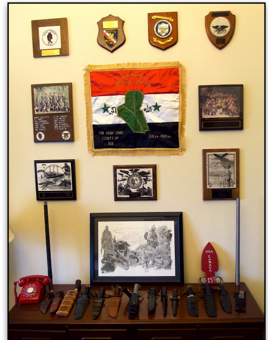
Congressman Ryan Zinke's office in DC sports a hotline, a wide variety of knives, a map of Iraq and quite a few plaques and awards, from an illustrious career.