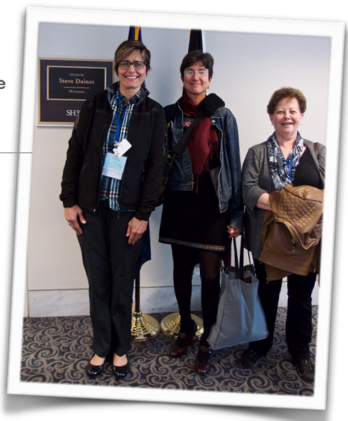
Three Country Mouse Postmasters in the Corridors of Power!