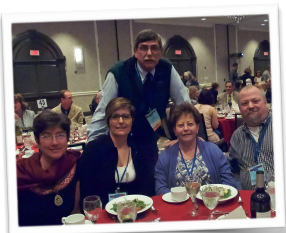
Banquet night at the conference in Washington

I will cooperate with you fully, but I do not waive any of my rights, including my right to remain silent. I will not sign a waiver-of-rights form, not admit or deny any allegations, nor make any written or oral statements unless my attorney and/or a NAPUS representative are personally present and so advise me.